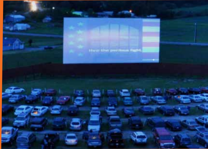
A modern drive-in theater.

Since pandemic restrictions are keeping large numbers of people from gathering indoors, people decided they might as well watch the movies outdoors in the comfort and safety of their own cars. Not only is it good for avid movie watchers, but it's also good for struggling drive-ins. Ever since the movie theatre was invented in 1905 theatres have continually evolved and become more advanced relying on new movie-watch-