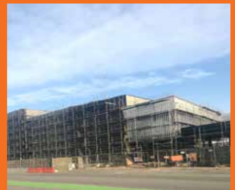
The construction process has shockingly progressed during school closure.

The old auditorium was used by multiple facilities, not just John Adams. SMC and other schools in SMMUSD used it. So many people could voice their opinions on the fate of the auditorium. Eventually, it was decided that they would demolish it and 20 million dollars were invested towards the construction of a new auditorium and performing arts center. The facility itself will have a more open design than the old auditorium, to reflect the goal of creating a thriving and active hub. The rehearsal and performance spaces open up to courtyards, reflecting the style of the main campus, and helping with temperature control. Along with JAMS, other schools will use the performing arts center as well. The main attraction of course is the auditorium