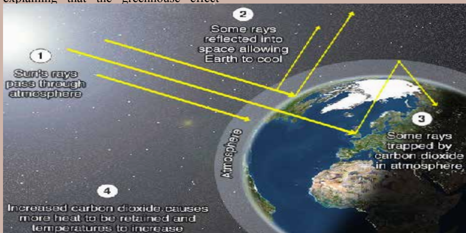
BBC’s explanation of greenhouse gases affecting climate change

If we don’t take immediate action, we are in for a catastrophe. But in addition to our efforts, our president and the rest of our government need to make new laws and regulations that will help prevent climate change. This is a community, and we ALL need to come together to make it through.