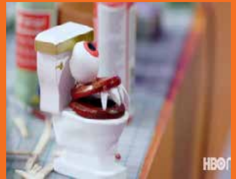
One of Sabrina’s creations for the Halloween dollhouse renovation - a creepy toilet!