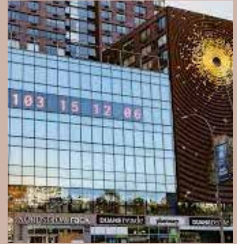
The “Climate Clock” prominently displayed at Metronome in New York City

One way of considering the dangers of climate change is to view the Climate Clock. Recently, in New York City, a new clock was unveiled that does a little more than tell the time. The climate clock is currently being shown at Metronome in Union Square in Manhattan. The New York Times says, “For more than 20 years, Metronome, which includes a 62-foot-wide 15-digit electronic clock that faces Union Square in Manhattan, has been one of the city’s most prominent and baffling public art projects... Now, instead of measuring 24-hour cycles, it is measuring what two artists, Gan Golan and Andrew Boyd, present as a critical window for action to prevent the