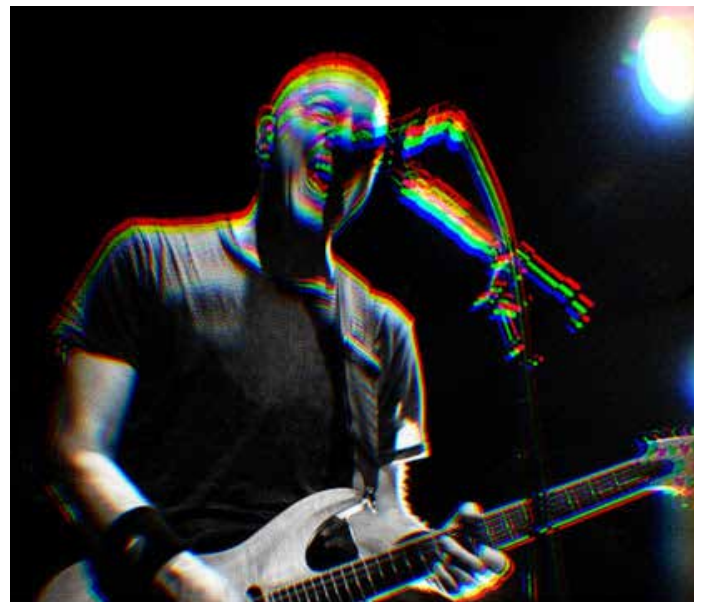
Page Hamilton performs in Australia with his band Helmet