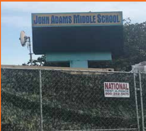
Famous parts of JAMS are in the construction zone like the famous sign.