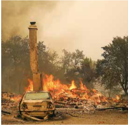
This California wildfire is an example of a lightning strike in high heat, fanned by wind, creating disaster.